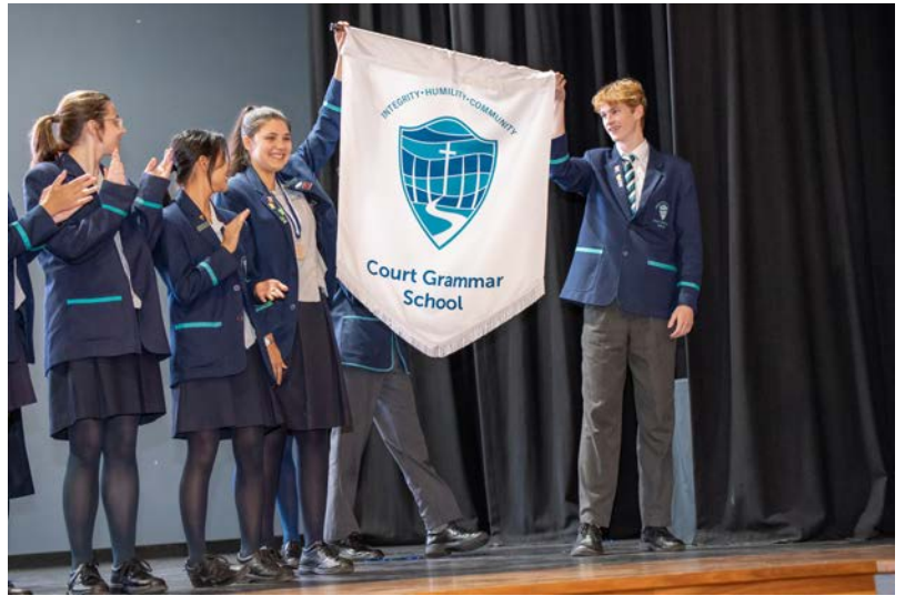
Our 2023 Student Leaders receiving the School flag.

They will be officially badged at the Sir Charles Court Futures Assembly early next year. Congratulations to all.