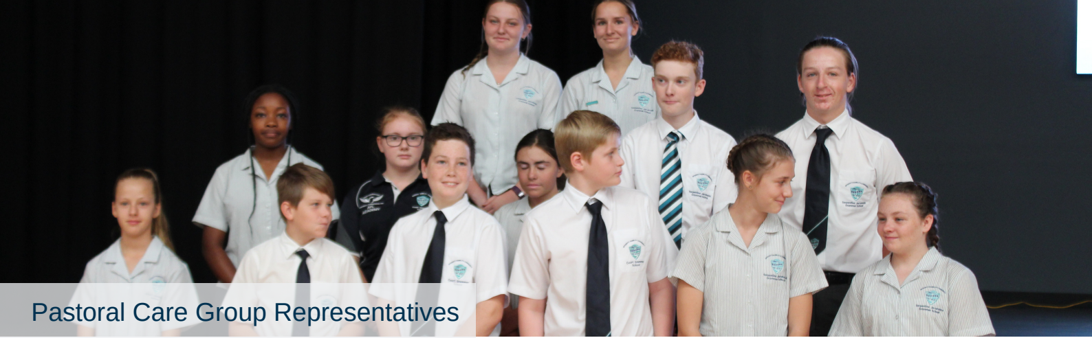
Pastoral Care Group Representatives