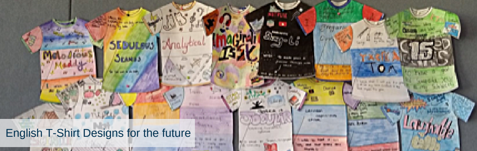
English T-Shirt Designs for the future