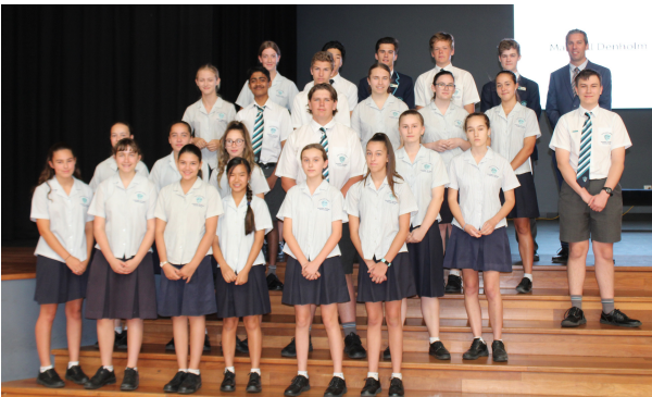
Academic Colours Recipients