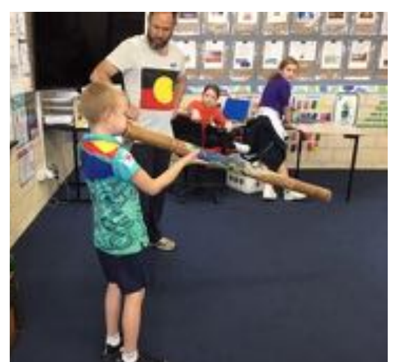
Mataari belting out the sweet drone of the dideridoo