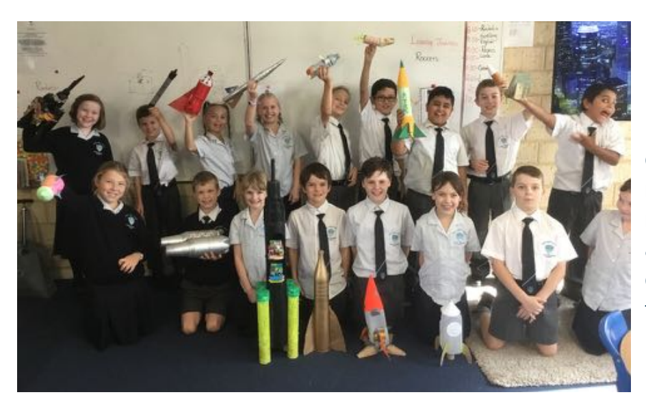
Mr Taylors' class has been studying Earth Sun and Moon over the last couple of weeks and have made rockets using recycled materials. The rockets had to accommodate 4 astronauts and the students had to explain the type of environmentally friendly fuel the rocket used.