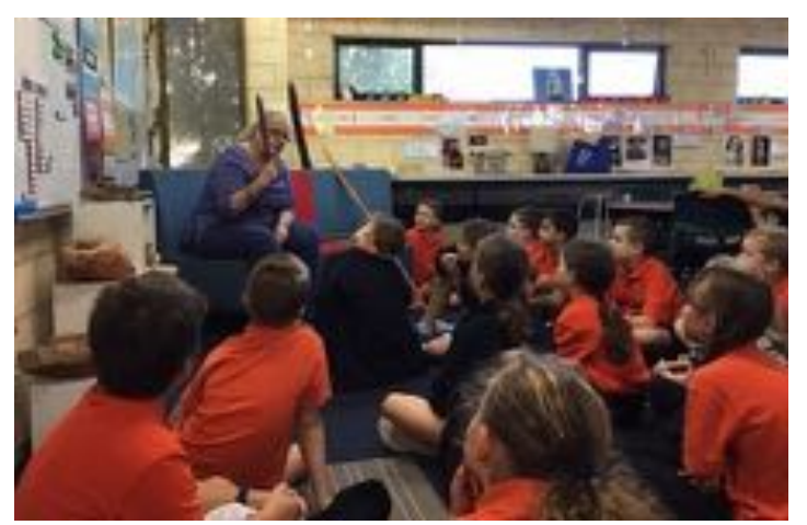
Learning about different types of Kylees (Boomerangs)