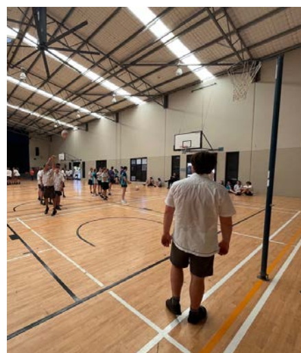
Year 9 / 10