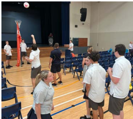
Year 11 Whitby's