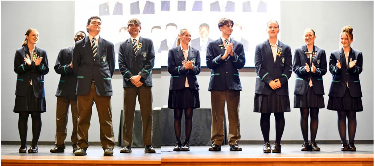
Our Year 12 Leaders for 2024