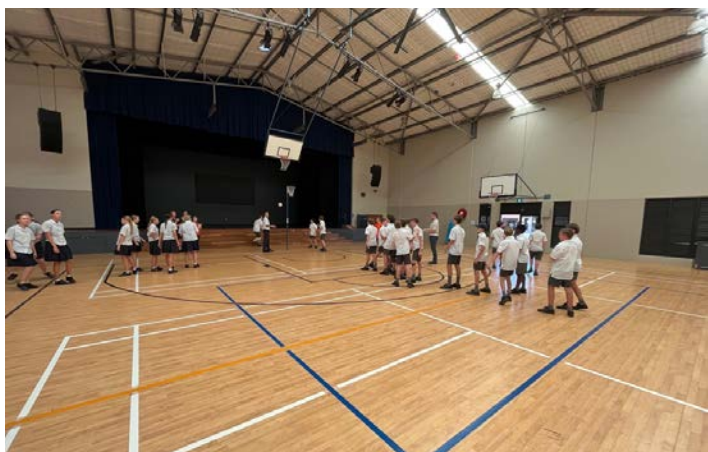
Year 7 / 8 Whitby's