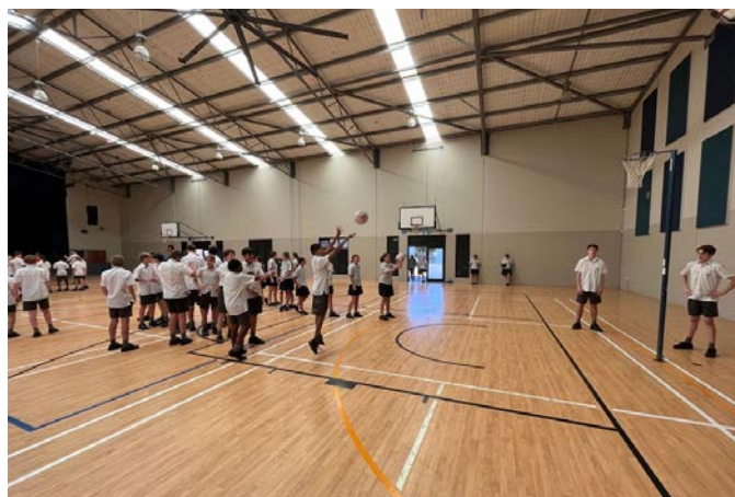
Year 7 / 8 Yarrabah's