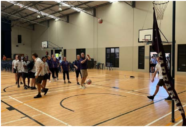
Yarrabah Staff represented exceptionally well with the Year 11's!